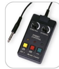
• HC-1 Timer Remote (Optional)