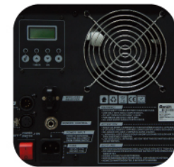
• Control Panel