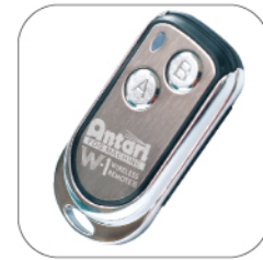
• W-1 Wireless Transmitter