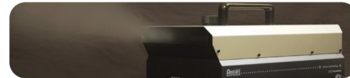
• HZ-350 Effect