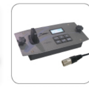
• Z-30PRO Wireless Control Module (Optional)