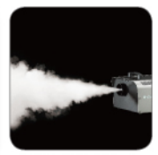
• Z-3000II Effect