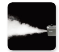
• Z-1500II Effect