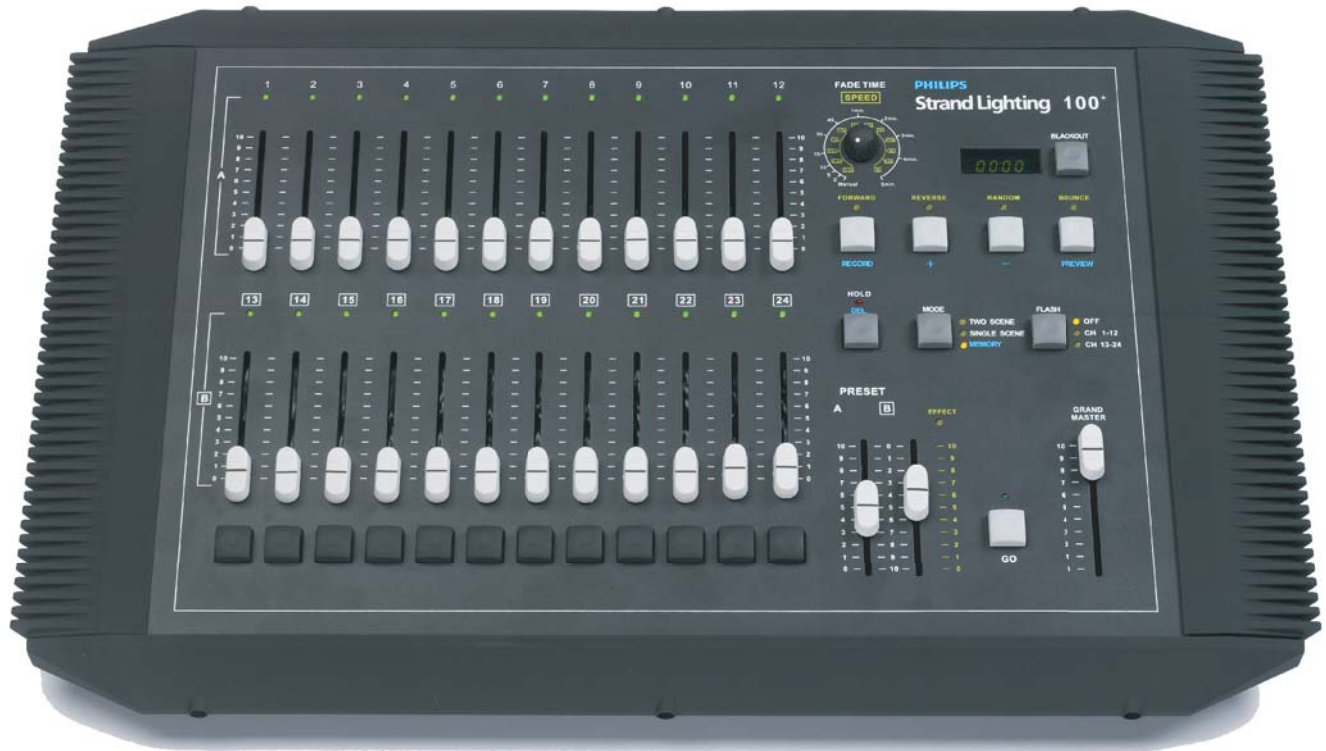
100 plus series 12/24 Lighting Control Console

Portable or Rack Mountable Control System